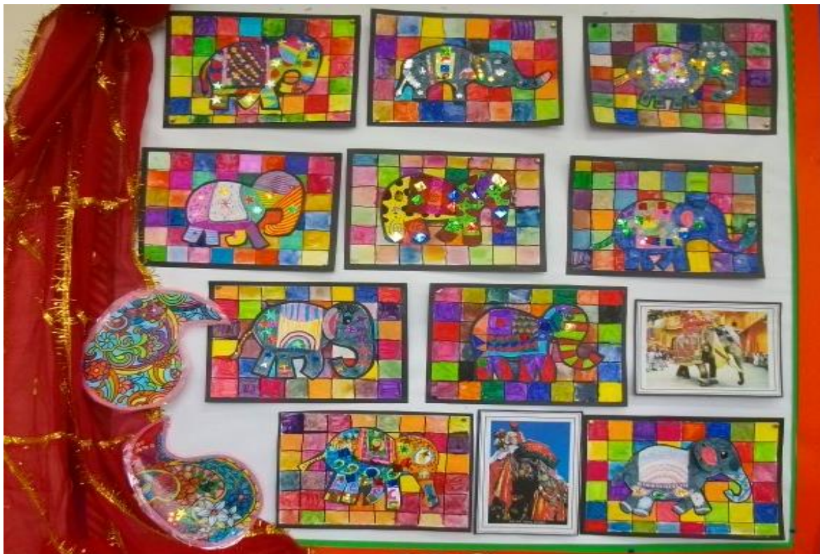
Schooner Class Indian Elephants

We aim to create an exceptional school that harbours confidence, respect and a love of learning and prepares children for the challenges and adventures of life.