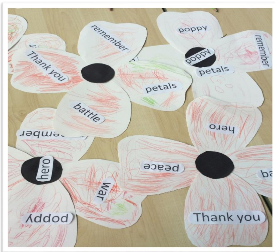
Our big remembrance poppys

We aim to create an exceptional school that harbours confidence, respect and a love of learning and prepares children for the challenges and adventures of life.