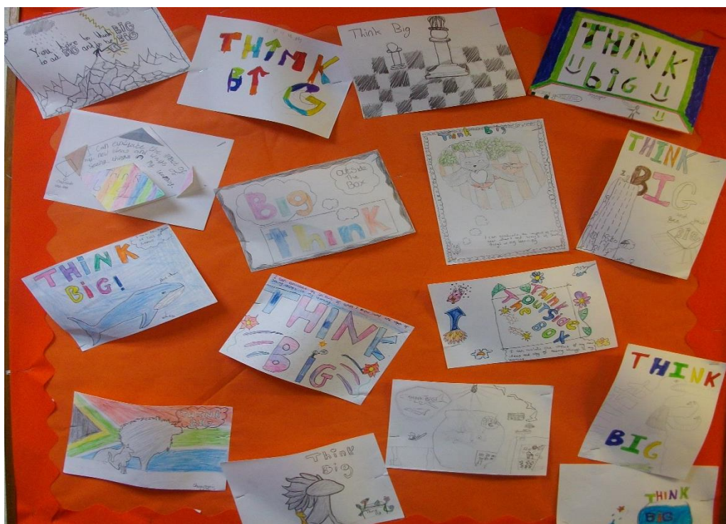
Thinking BIG with Schooner Class

We aim to create an exceptional school that harbours confidence, respect and a love of learning and prepares children for the challenges and adventures of life.