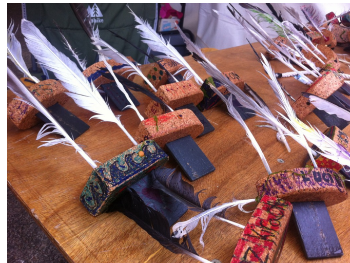
Thank you Dan for helping us make our cork boats

We aim to create an exceptional school that harbours confidence, respect and a love of learning and prepares children for the challenges and adventures of life.