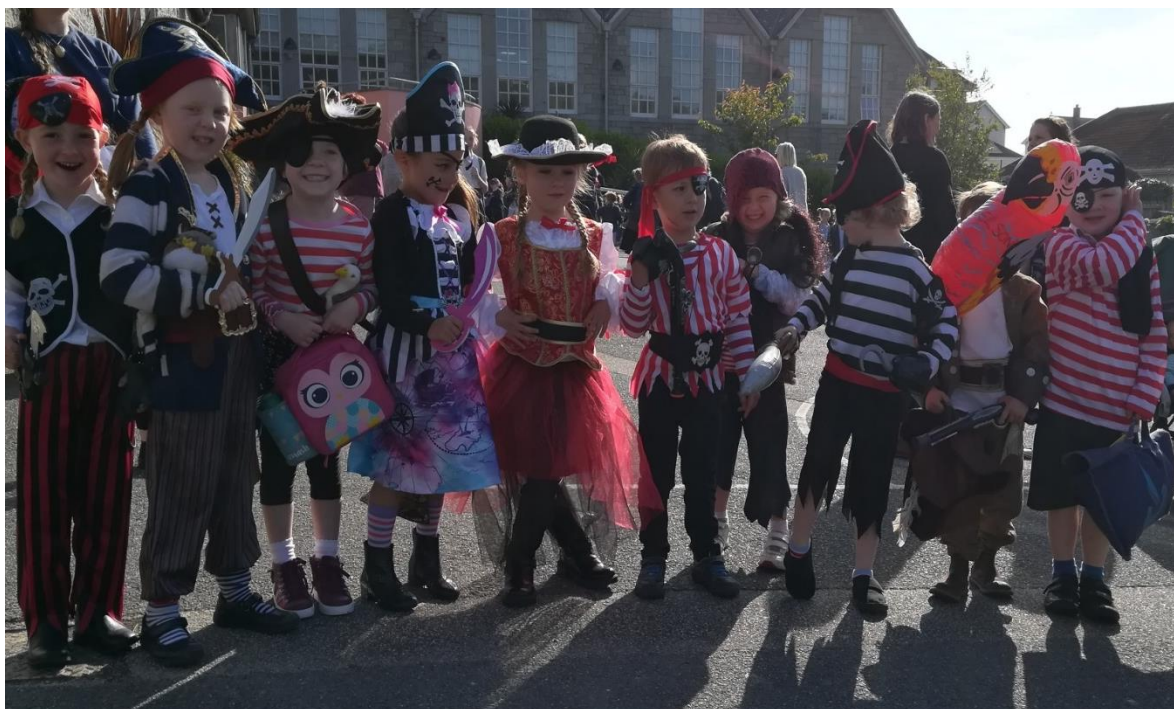
Dinghy Class pirates

We aim to create an exceptional school that harbours confidence, respect and a love of learning and prepares children for the challenges and adventures of life.