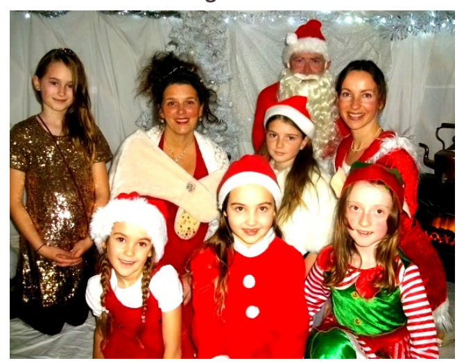
Merry Christmas to you all

We aim to create an exceptional school that harbours confidence, respect and a love of learning and prepares children for the challenges and adventures of life.