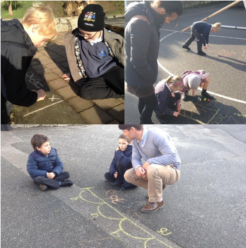
Some super outdoor maths in Luggar Class last week.