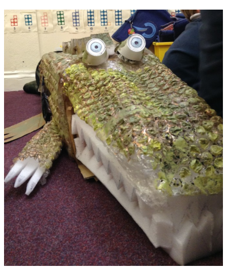
The life size crocodile in Skiff Class

We aim to create an exceptional school that harbours confidence, respect and a love of learning and prepares children for the challenges and adventures of life.