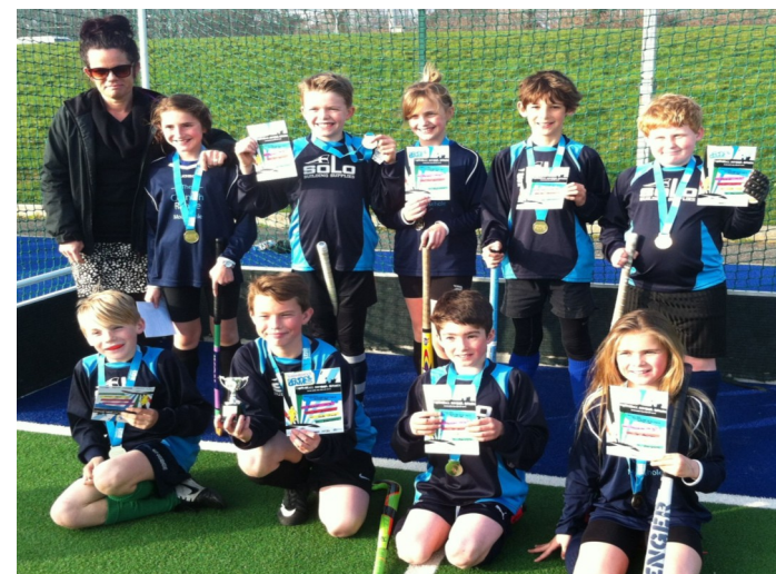
Our hockey winners!

We aim to create an exceptional school that harbours confidence, respect and a love of learning and prepares children for the challenges and adventures of life.