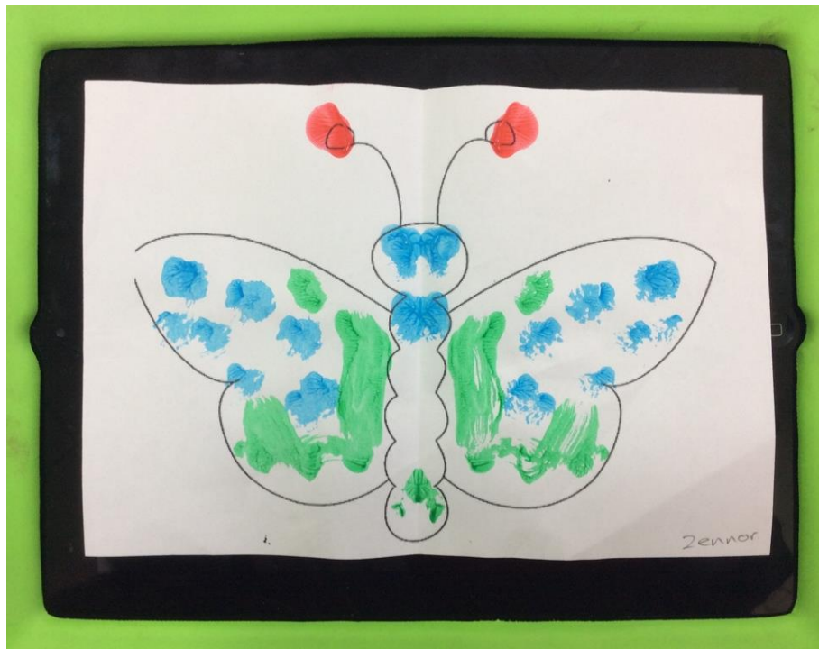
Some symmetrical art from Dinghy Class

We aim to create an exceptional school that harbours confidence, respect and a love of learning and prepares children for the challenges and adventures of life.