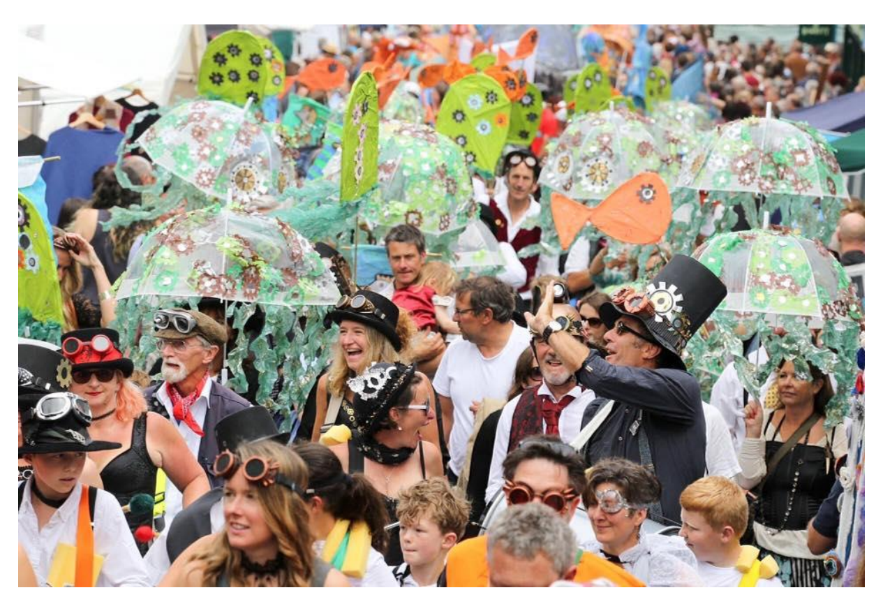
Mazey Day 2017

We aim to create an exceptional school that harbours confidence, respect and a love of learning and prepares children for the challenges and adventures of life.