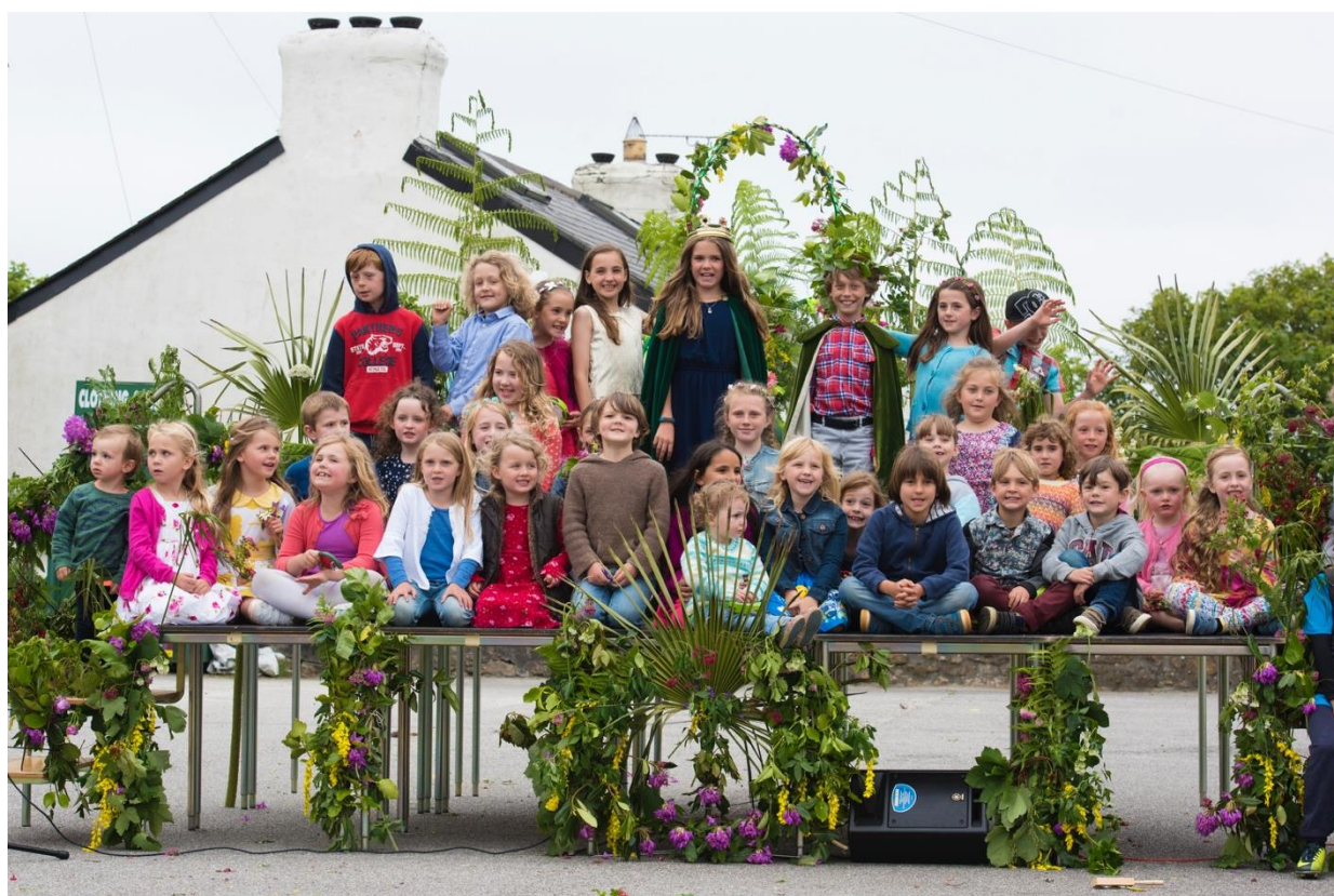
The May Queen, King and attendees

We aim to create an exceptional school that harbours confidence, respect and a love of learning and prepares children for the challenges and adventures of life.