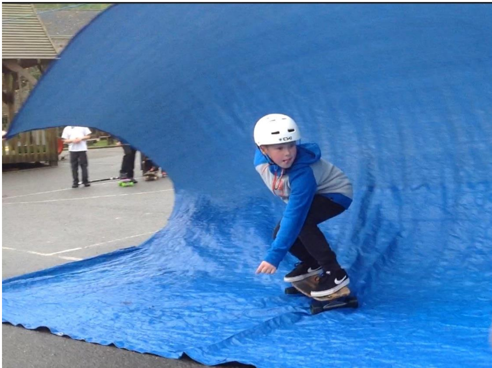
Practising tube riding through the obstacles at skate club

We aim to create an exceptional school that harbours confidence, respect and a love of learning and prepares children for the challenges and adventures of life.