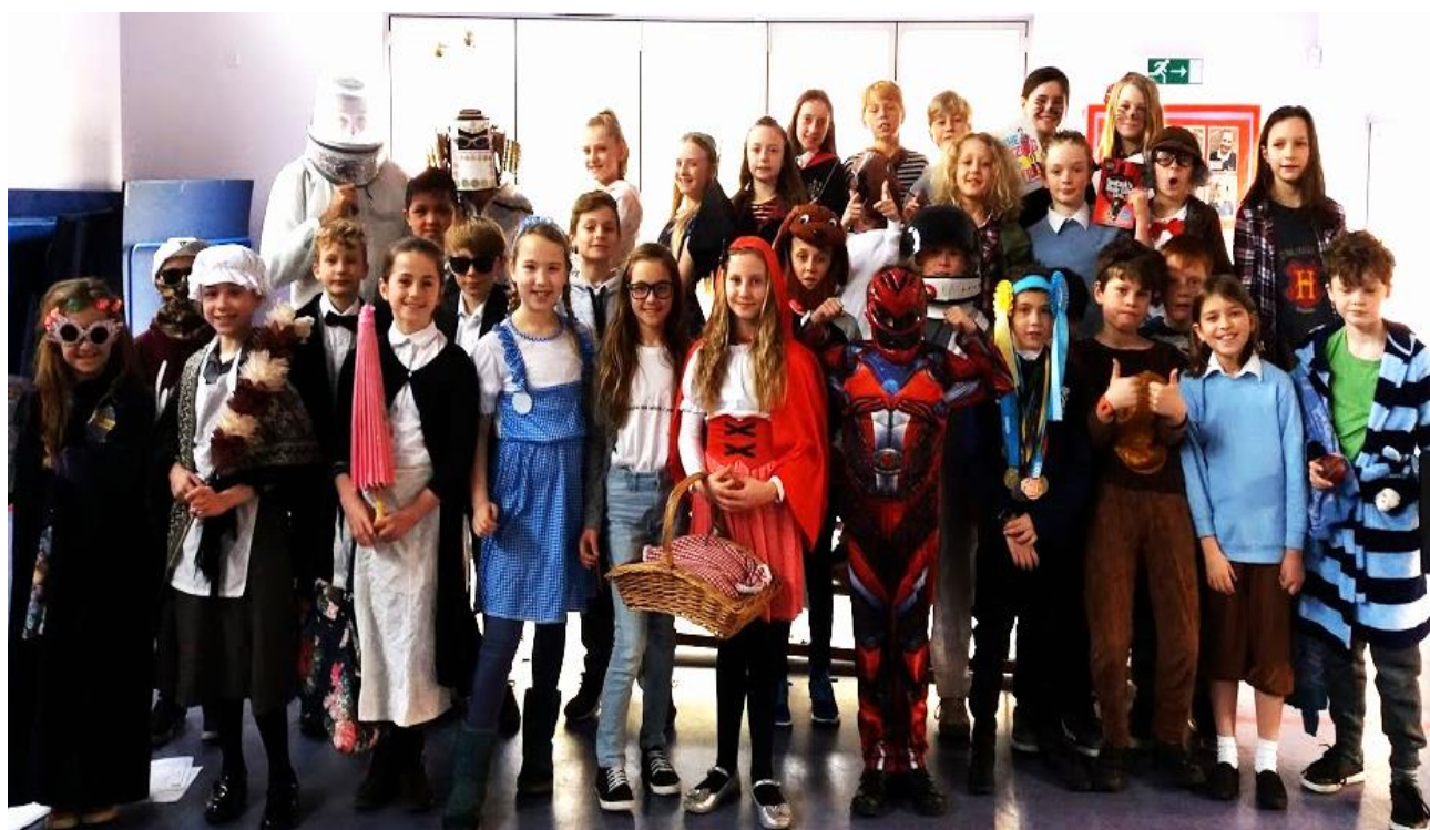
Celebrating World Book Day

We aim to create an exceptional school that harbours confidence, respect and a love of learning and prepares children for the challenges and adventures of life.