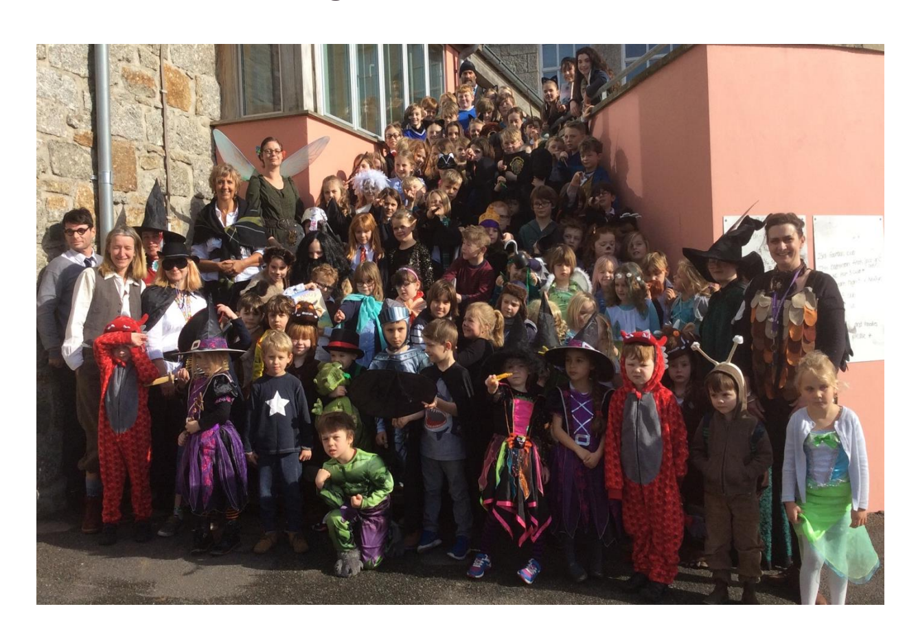
Celebrating World Book Day 2017

We aim to create an exceptional school that harbours confidence, respect and a love of learning and prepares children for the challenges and adventures of life.