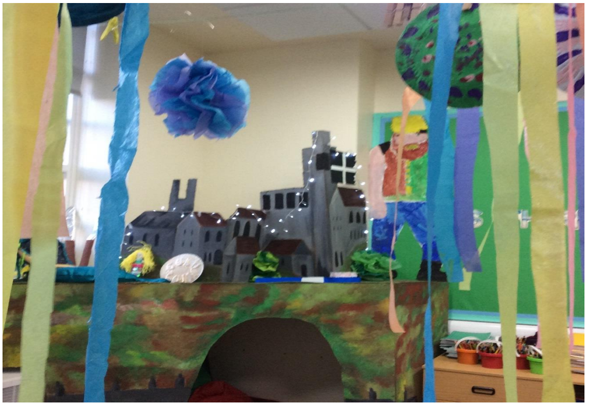
Skiff Class Giant & St Michaels Mount

We aim to create an exceptional school that harbours confidence, respect and a love of learning and prepares children for the challenges and adventures of life.