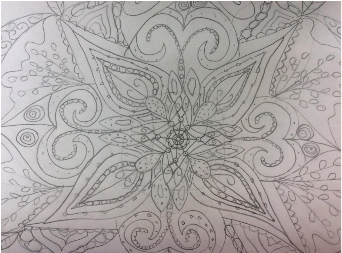
A beautiful mandala from Schooner Class

We aim to create an exceptional school that harbours confidence, respect and a love of learning and prepares children for the challenges and adventures of life.