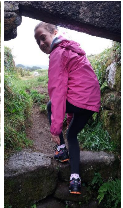
Schooner Class ventured to Carn Euny on a misty

Monday morning to explore the Iron Age village. They learnt about what the village would have looked like 2000 years ago and how the inhabitants would have lived. We also compared life in Britain during the Iron Age to other civilisations around the world. They had great fun exploring the underground fogou and imagining themselves living there when it was a bustling village. Next stop, the Eden Project to explore the ancient Maya civilisation.