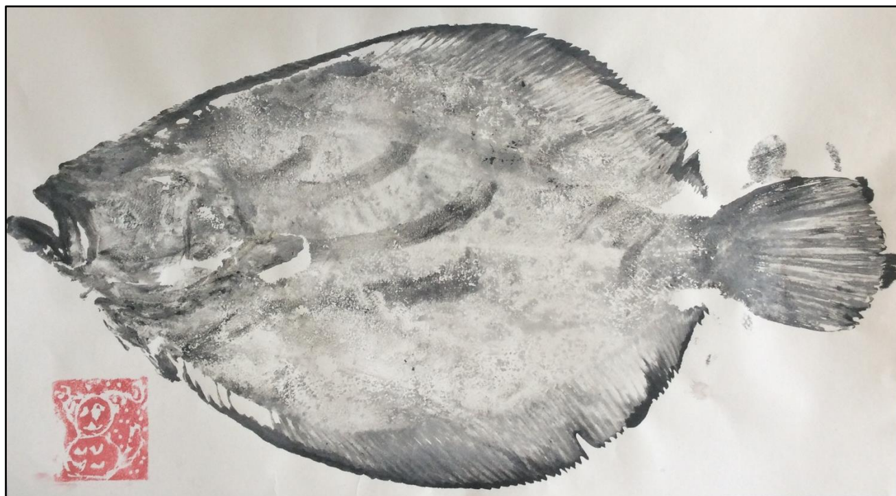
A gyotaku squid ink print from Schooner class

We aim to create an exceptional school that harbours confidence, respect and a love of learning and prepares children for the challenges and adventures of life.